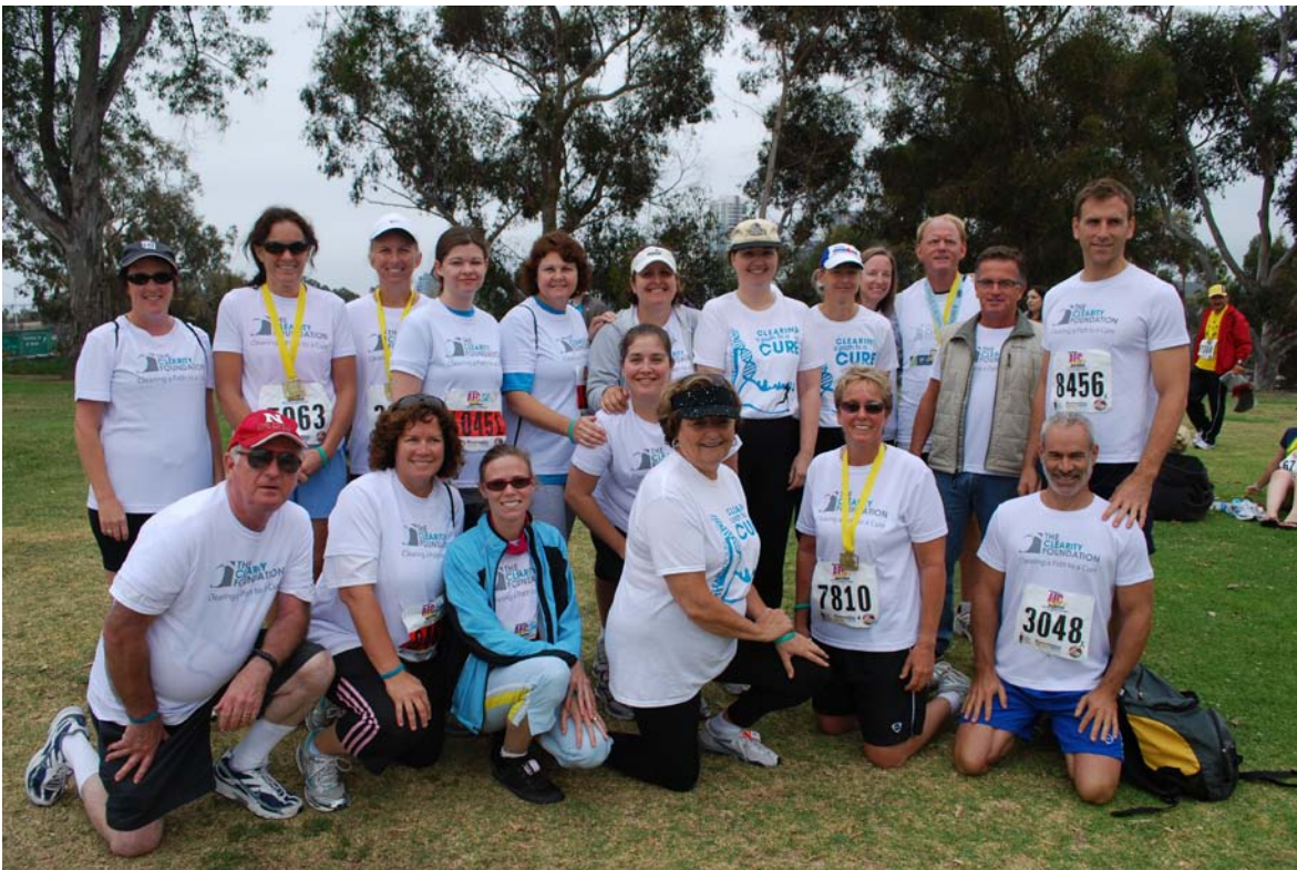
Ovarian Cancer Cures TODAY!